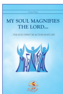
MY SOUL MAGNIFIES THE LORD... ...THE HOLY SPIRIT IN ACTION IN MY LIFE

For more information visit our Website: www.iccrs.org